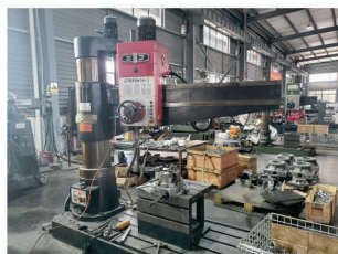
Radial drill press