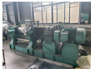
Rubber Open mill