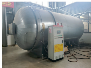
Large Vulcanization Tank