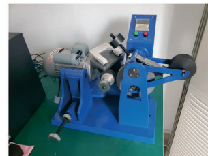
Akron Attrition Machine