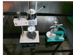
Hardness Tester/Thickness Gauge