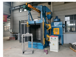
Shot Blasting Machine